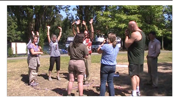
FIG. 2. Teachers in a secondary science professional development course perform Energy Theater for the lowering scenario.

An Energy Theater enactment illustrates a group's shared understanding of the energy scenario. For example, a group of teachers as learners shown in Fig. 2 analyzes the scenario of a ball being lowered at constant velocity by a person